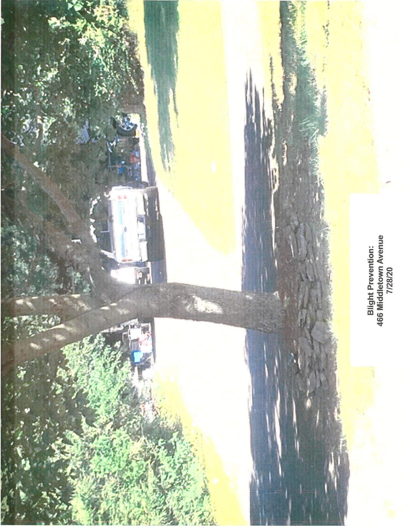
Blight Prevention: 466 Middletown Avenue 7/28/20