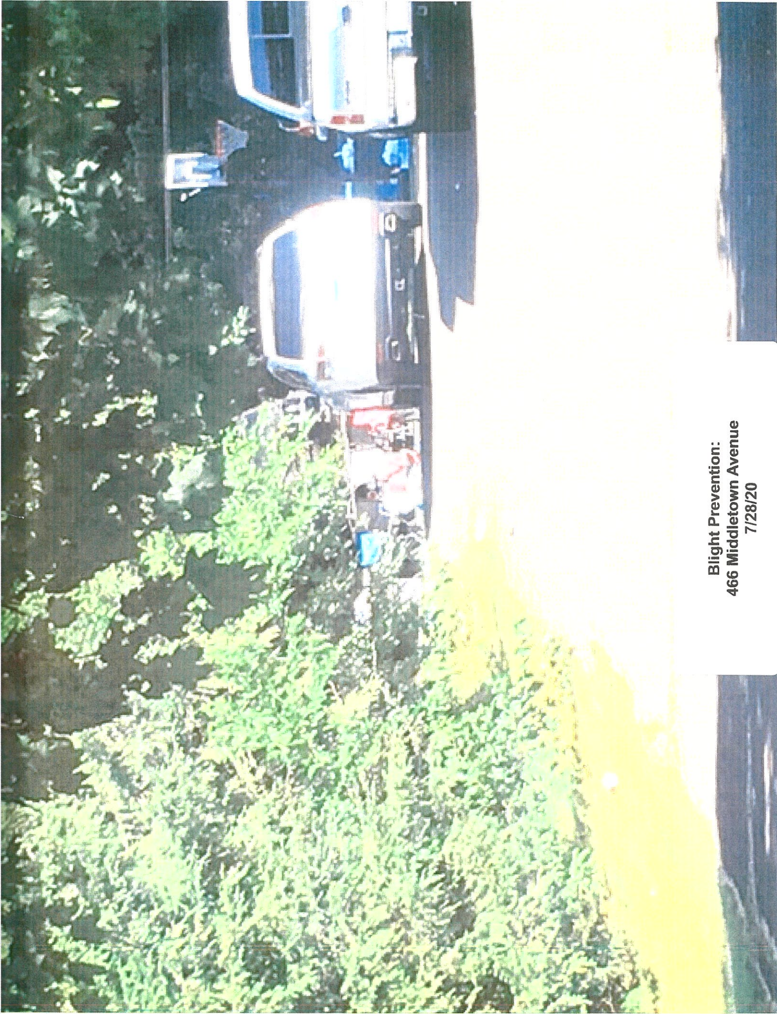
Blight Prevention: 466 Middletown Avenue 7/28/20